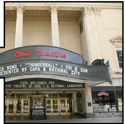
Columbus Assoc. for the Performing Arts