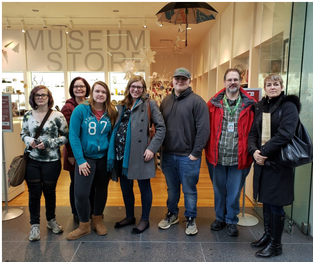
Tri-County TRIO students toured the Columbus Museum of Art, December 8th, 2018.