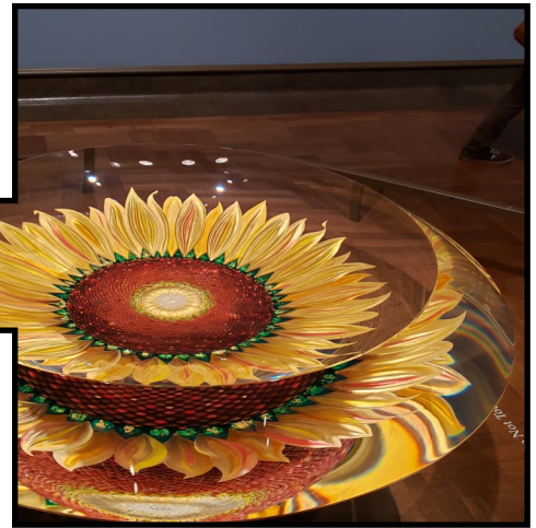
Columbus Museum of Art