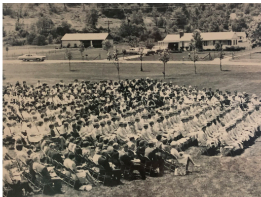
This photo from the Hocking College archives shows the first Hocking College graduating class in 1970.

Throughout the 1980s, HTC continued to grow. As buildings and programs expanded, HTC became renowned for its Natural Resources, Nursing, Public Safety, and Culinary and Hospitality programs. During the 1990s, Hocking Technical College became known as Hocking College. A satellite campus was opened in Perry County, and the college acquired Lake Snowden, a live learning lab for Natural Resources Programs.