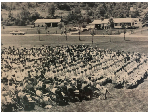
This photo from the Hocking College archives shows the first Hocking College graduating class in 1970.

Throughout the 1980s, HTC continued to grow. As buildings and programs expanded, HTC became renowned for its Natural Resources, Nursing, Public Safety, and Culinary and Hospitality programs. During the 1990s, Hocking Technical College became known as Hocking College. A satellite campus was opened in Perry County, and the college acquired Lake Snowden, a live learning lab for Natural Resources Programs.